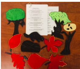
00981 - Fall Pack #2