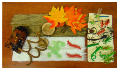
05097 - Fall Exploration