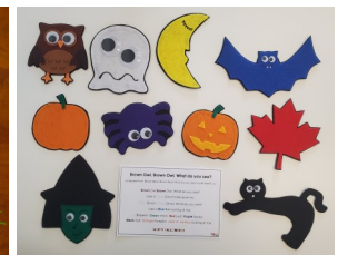
22878 - Brown Owl, Brown Owl, What Do You See?