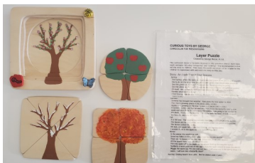
22852 - An Apple Tree in Four Seasons