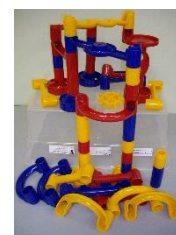
22787 Super Marble Run