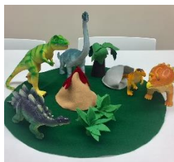
11491 Dinosaur Play Set