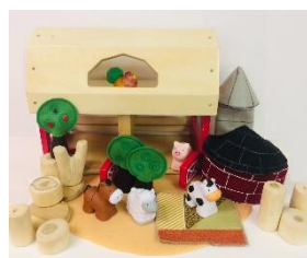
00114 Farm Animals