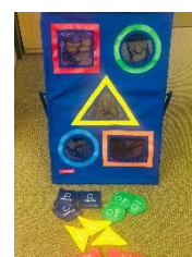
07663 Shape Toss