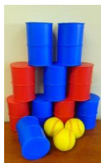
11673 Knock Down Cans