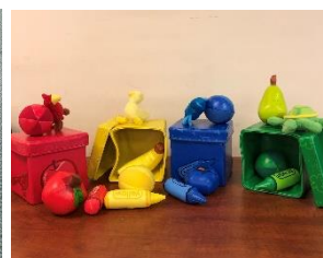
12721 Colour Discovery Boxes