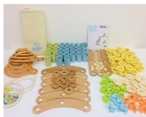
14974 Bamboo Marble Run