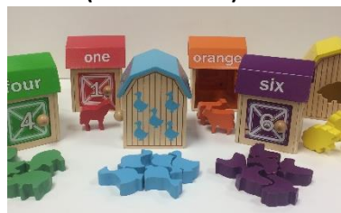
06350 Barnyard Activity Boxes