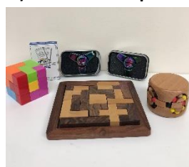
12838 Brain Teasers