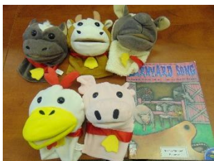
11715 Barnyard Song