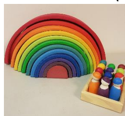
00155 Rainbow and Friends