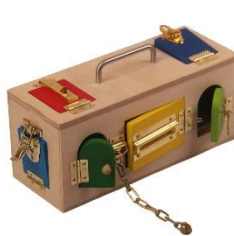
15203 Lock Box