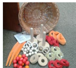
23579 Sensory Stacking Tower