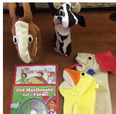
11368 Old MacDonald Had a Farm