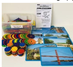
06715 Bridge Building Centre