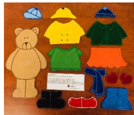
02904 Weather Bear