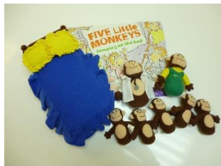
11640 Five Little Monkeys