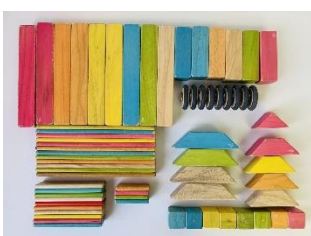
09347 Tegu Magnetic Blocks