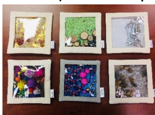
10246 See Through Bags