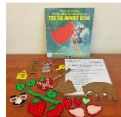
09263 The Big Hungry Bear