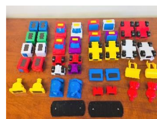
12739 Magna Cars & Trucks