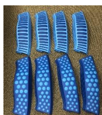
16391 Wavy Paths