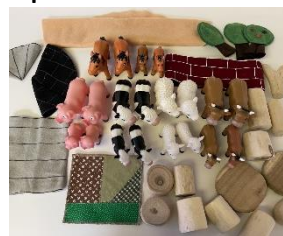
09958 Tree Blocks & Farm Animals