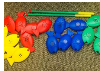
15401 Giant Fishing