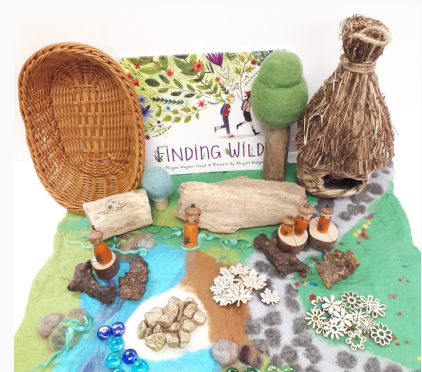
15708 Woodland Playscape