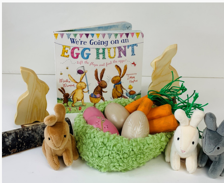
36902 Egg Hunting