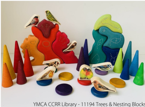
YMCA CCRR Library - 11194 Trees & Nesting Blocks