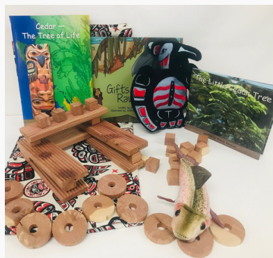
32448 Gifts from Raven