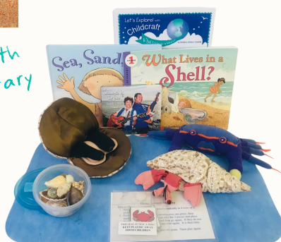
06582 What Lives in a Shell?

...then extend it with one of our Library resources!”