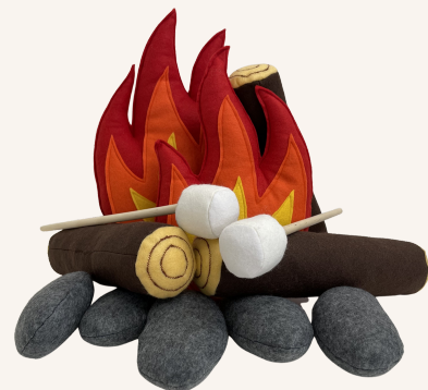
33354 Campfire Set

The birds in the trees go tweet tweet tweet The camp leader says, "Let's go hike!" The moon at night glows so bright The water in the river goes whoosh whoosh whoosh