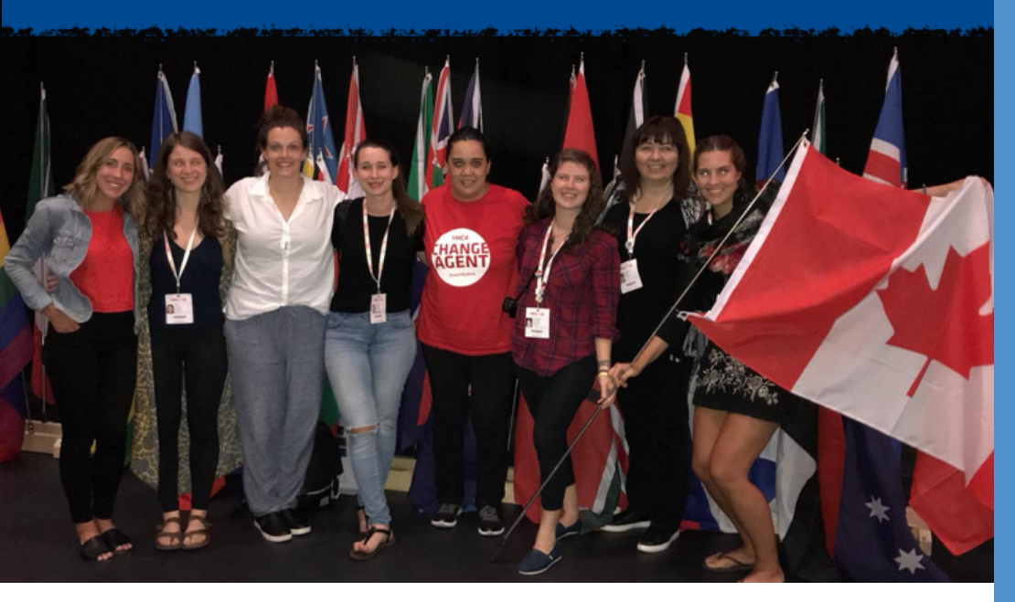
Y 175 Conference delegates