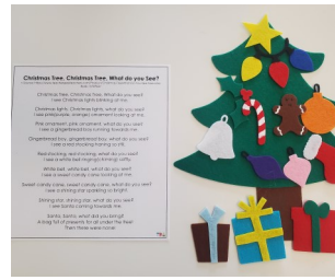
T522886: Christmas Tree, What do you see?