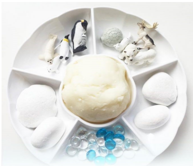
'Arctic' Playdough Tray

Let's face it, winters in the lower mainland look similar to our late fall and early spring, but a little colder. Occasionally, we see snow, and it's such an exciting time when we do! Here are some ideas to bring that snow, and hopefully excitement, into your provocations and program planning in the months ahead.