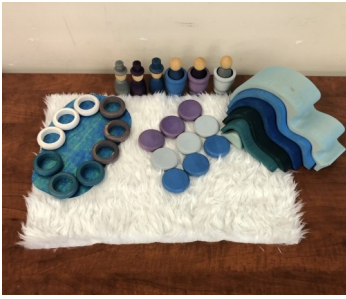
T1-13844: Winter Nin Scenery