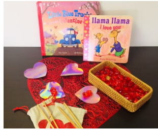
T1-30046: Valentine's Tales