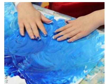
'Polar' Finger Painting