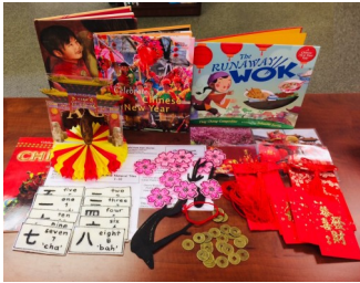
T5-06384: Chinese New Year Kit