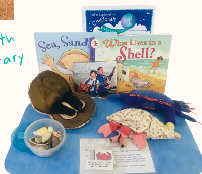
06582 What Lives in a Shell?

...then extend it with one of our Library resources!”