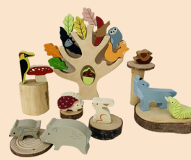
33156 Stacking Animals