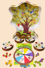
22746 Squirrel Game