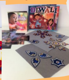
32174 Diwali Lights

Diwali, or Dipawali, is India's biggest and most important holiday of the year. Over the centuries, Diwali has become a national festival that's also enjoyed by non-Hindu communities. The festival gets its name from the row (avali) of clay lamps (deepa) that Indians light outside their homes to symbolize the inner light that protects from spiritual darkness. This festival is as important to Hindus as the Christmas holiday is to Christians. Diwali is celebrated over five days.