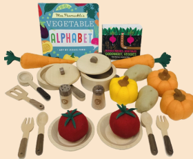
37298 Cooking Vegetables