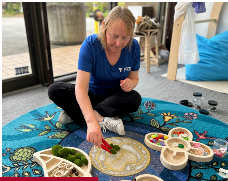
36845, 37033 & 36837 - Loose Parts Wooden Trays