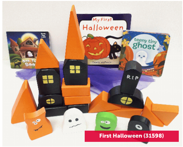
First Halloween (31598)

👻 Spooky learning made fun! Dive into our Halloween resource filled with crafts, games, and tips to make this season magical for children and families. 🧛❤️