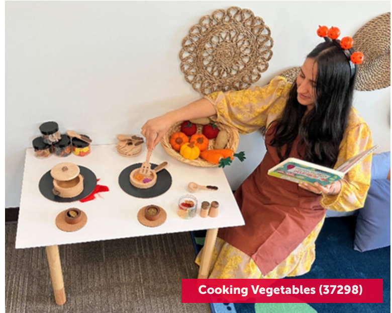
Cooking Vegetables (37298)

🍂🔍 Pumpkin season is here! Explore our fall resource filled with hands-on cooking fun, pumpkin-themed activities, and delicious ways to celebrate the harvest with children and families. 🍁🥕