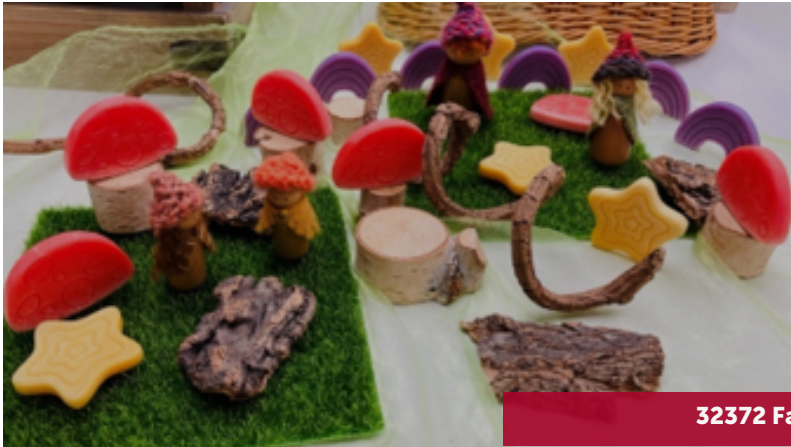
32372 Fairy Tale Play

These two amazing resources will inspire endless adventures and imaginative moments. They're perfect for creating opportunities where children can explore, invent, and connect with the natural world in meaningful ways.