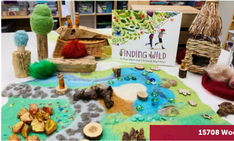
15708 Wooden Playscape

Nature and outdoor play are some of her favourite ways to give children the time and space to express themselves through imaginative play. Unstructured environments open the door for creative storytelling, and when you add loose parts to your provocation, it deepens a child's connection to nature.